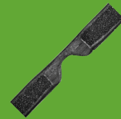
FastVent™ PLUS III