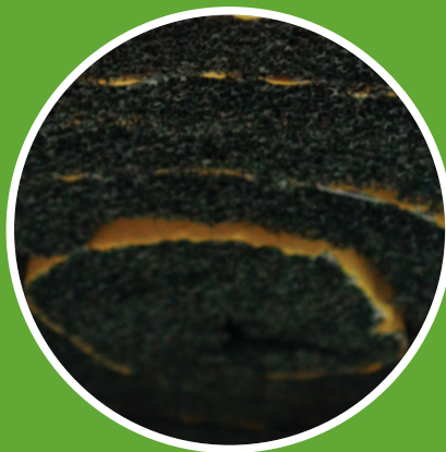
Foam Construction Prevents Weather Damage